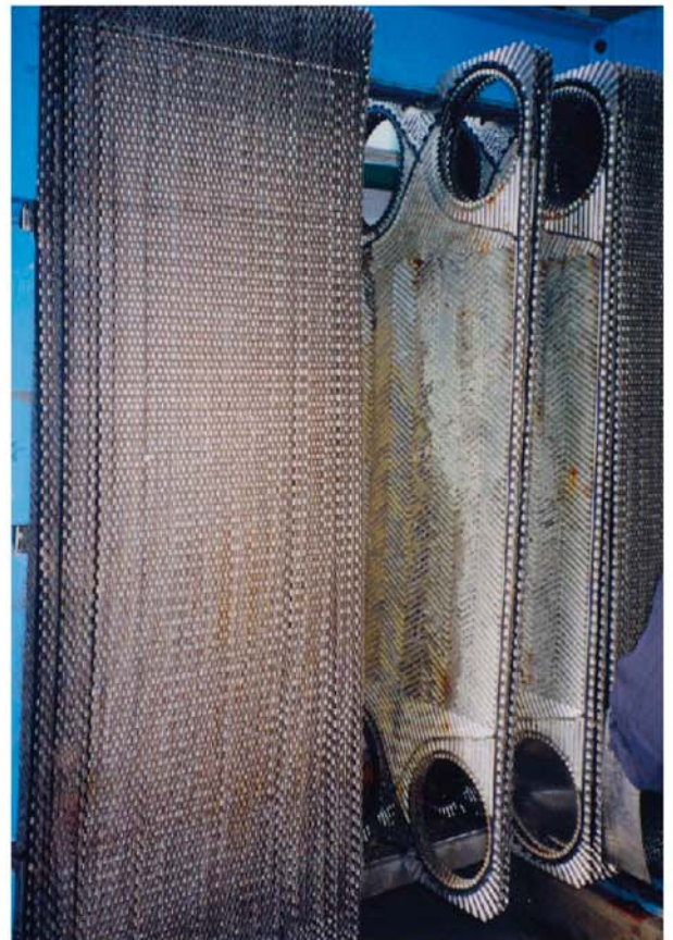
CONTROL OF HONEY COMB FILL OF COOLING TOWER