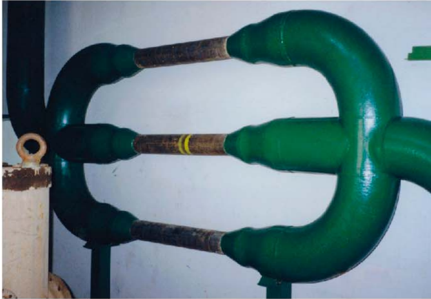
SITUATION BEFORE INSTALLATION – ADJUSTMENT OF TUBE Ø