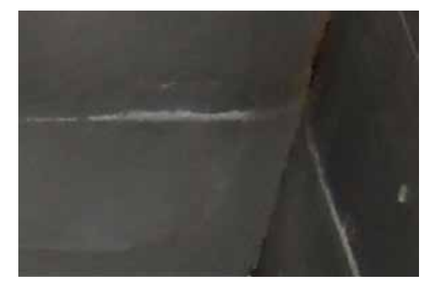
Picture 1: Etched stainless steel after only 3 weeks in service, without using Vulcan.

The installation of Vulcan 1000 and Vulcan 5000 solved this hard build-up problem successful.